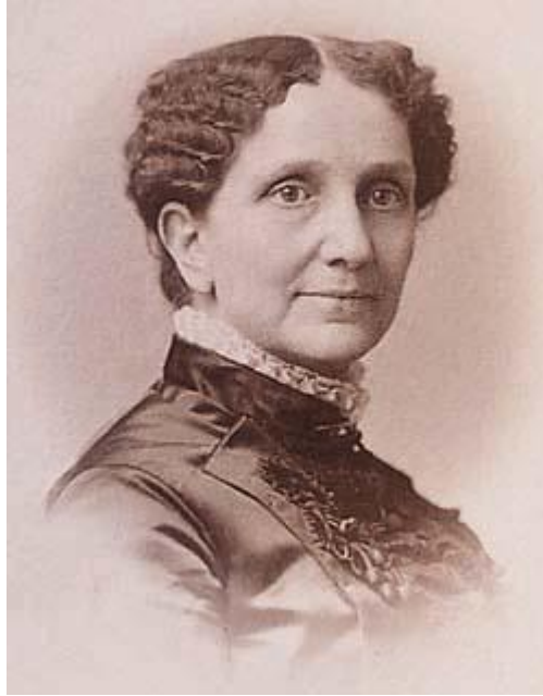
Photograph of Mary Baker Eddy - ca 1900

Mary Baker Eddy Scientist and Christian Philosopher 1821-1910