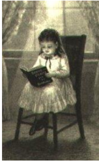
Is The Pastor Emeritus dead?